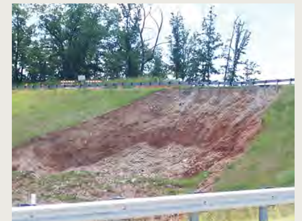
Landslide along a Missouri roadway.

Rockfalls are common hazards in areas that have bluffs or extremely steep hillsides. The most hazardous are bluffs that contain thick beds of sandstone or carbonate rock underlain by shale. The shale will often become soft and weather out, leaving large pieces of balanced rock. Bluffs of highly fractured rock are also at great risk for rockfalls. As with landslides and slumps, rockfalls are also more likely to occur during times of heavy rains.