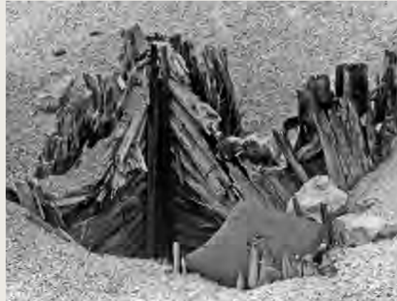
Abandoned mine shaft in southwest Missouri.

Geologic maps and other geologic and hydrologic publications are available from the Missouri Geology Store by visiting this website missourigeologystore.com