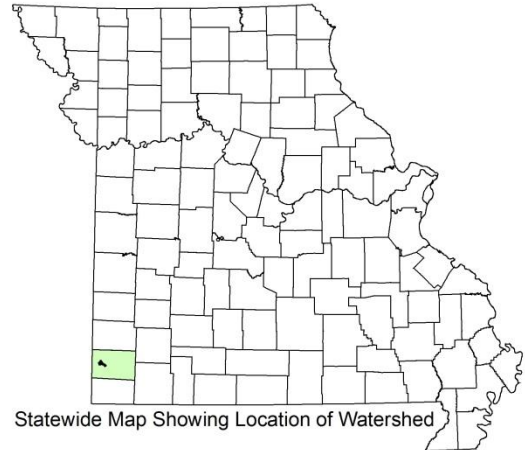
Statewide Map Showing Location of Watershed

County: Newton Nearby City: Neosho Length: 2.2 miles Pollutant 1: Bacteria Pollutant 2: Metals in sediment (Cadmium, Lead and Zinc) Source 1: Rural nonpoint sources Source 2: Mill tailings