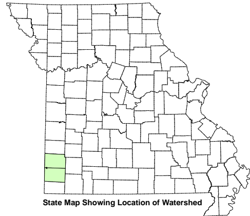
State Map Showing Location of Watershed

County: Jasper and Newton Nearby City: Joplin Length: 1.6 miles Pollutants: Cadmium and Zinc Source: Tanyard Hollow Pits