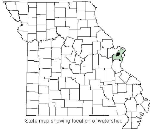
State map showing location of watershed

County: St. Louis Nearby Cities: Maryland Heights Area of impairment: 300 Acres Pollutant: Chlordane Source: Urban nonpoint runoff