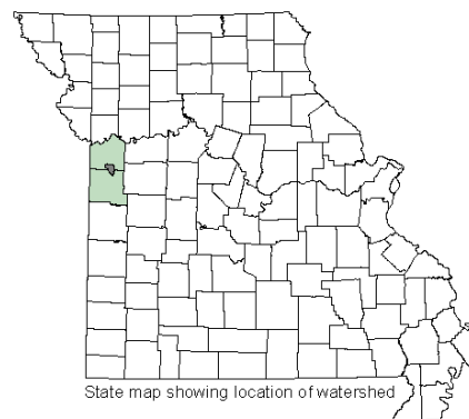
State map showing location of watershed

County: Cass Nearby Cities: Pleasant Hill, Greenwood, Lee's Summit Area of impairment: 115 acres Pollutant: Chlordane Source: Unknown