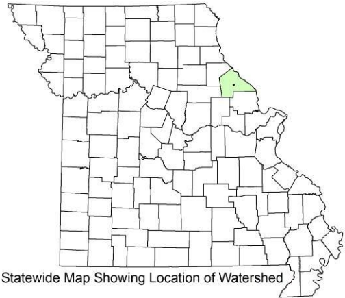
Statewide Map Showing Location of Watershed

County: Pike Nearby City: Bowling Green Size of Lake: 29 acres 1 Pollutants: Nitrogen and phosphorus Source: Nonpoint sources