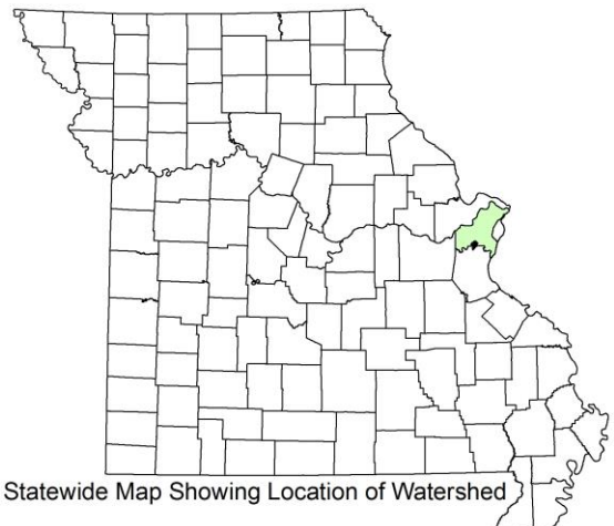
Statewide Map Showing Location of Watershed

County: St. Louis Nearby City: Valley Park Segment Length: 1 mile Watershed Size: 9.5 square miles Pollutant: Bacteria Source: Urban and rural runoff