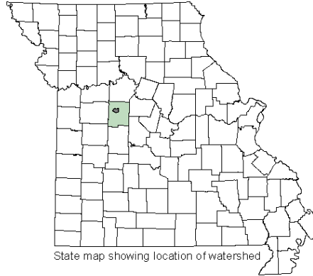
State map showing location of watershed

County: Pettis Nearby City: Sedalia Length: 1 mile Pollutants: Chloride Source: Tyson Foods, Inc.