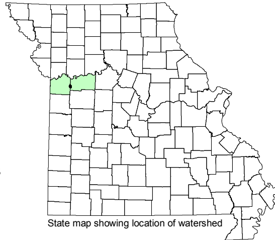
State map showing location of watershed

Counties: Lafayette, Jackson Nearby Cities: Oak Grove Length of impairment: 3.1 miles Pollutants: Biochemical Oxygen Demand (BOD) and Ammonia Source: Oak Grove North and South Wastewater Lagoons Water Body ID: 3413