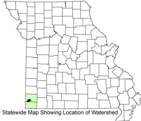
Statewide Map Showing Location of Watershed

Counties: McDonald and Newton Nearby City: Neosho Length: 8 miles Pollutant: Fishes bioassessments Source: Unknown