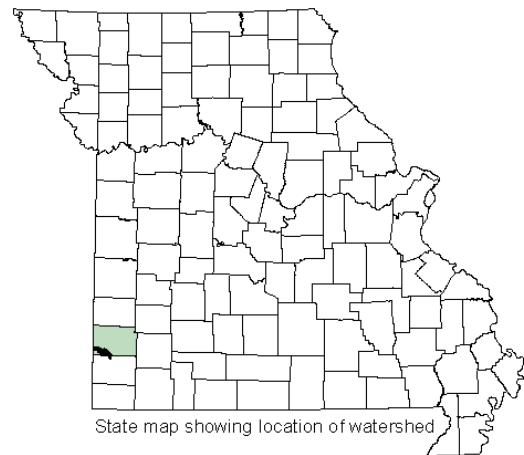
State map showing location of watershed

County: Jasper Nearby City: Joplin Turkey Creek Length: 7.7 miles (3216) 6.1 miles (3217) Tributaries Length: 2.9 miles (3983) 2.2 miles (3984) 1.6 miles (3985) Pollutants: Cadmium, Lead and Zinc (in sediment and water) Source: Tri-State Mining District