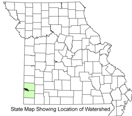
State Map Showing Location of Watershed

County: Jasper Nearby City: Joplin Length: Water body 3216: 7.7 miles Water body 3217: 6.1 miles Pollutant: E. coli bacteria Source: Rural nonpoint sources