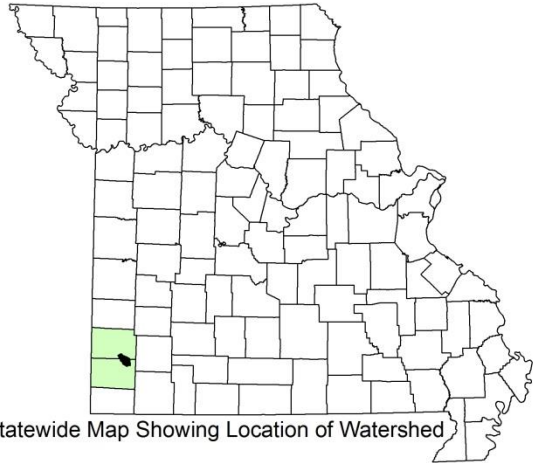
Statewide Map Showing Location of Watershed

County: Jasper and Newton Nearby City: Fidelity Segment Length: 2.8 miles (3207) 4.8 miles (3208) Pollutant: Bacteria Source: Rural nonpoint sources