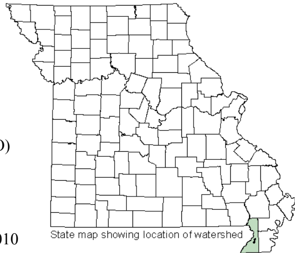
State map showing location of watershed

County: Dunklin Nearby Cities: Kennett Length of impaired segment: 18.0 miles Length of impairment within segment: 3.0 miles Pollutant: Low Dissolved Oxygen (DO) Source: Kennett Wastewater Treatment Plant (WWTP) Water Body ID: 3118