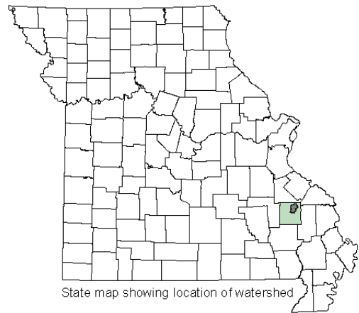
State map showing location of watershed

County: Madison Nearby Cities: Fredericktown Lengths of impairment: 0.5 mile (Goose Creek) 0.5 mile (Saline Creek) Pollutant: Nickel Source: Madison mine artesian flow