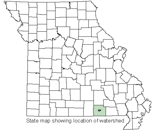
State map showing location of watershed

TMDL Priority Ranking: TMDL Approved 2001