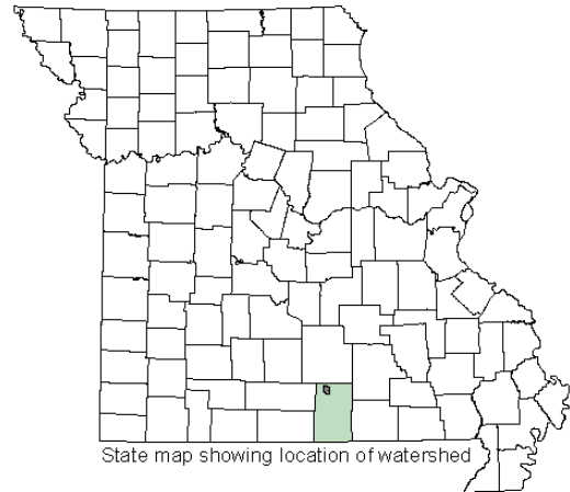
State map showing location of watershed

Note: Eleven Point River was added to the 2002 303(d) list for Mercury. See the Mercury Information Sheet.