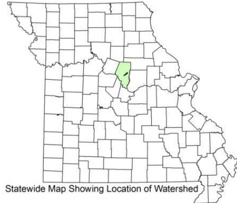
Statewide Map Showing Location of Watershed

County: Boone Nearby City: Columbia Water Body ID: 1011 Segment Length: 1 mile Pollutant: E. coli bacteria Source: Runoff – various 1