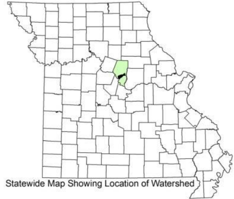
Statewide Map Showing Location of Watershed

County: Boone Nearby City: Columbia Length: 9 miles Pollutant: E. coli bacteria Source: Unknown