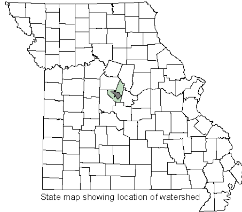
State map showing location of watershed

County: Moniteau Nearby Cities: California Length of impairment: None Pollutants: None Source: None