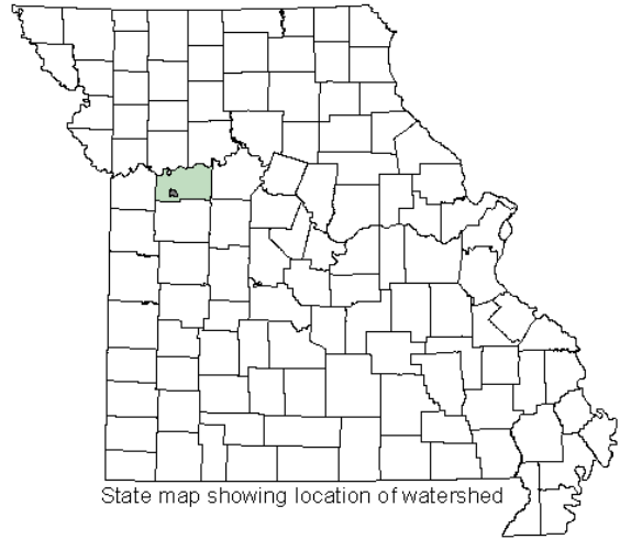
State map showing location of watershed

TMDL Priority Ranking: TMDL Completed 2003