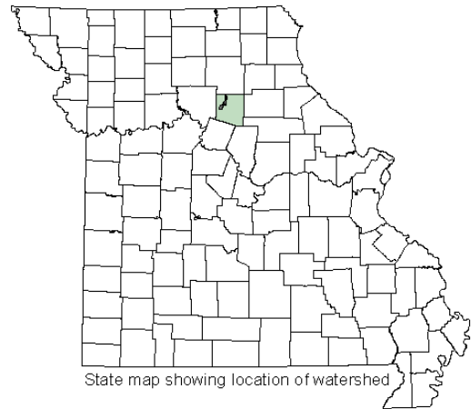
State map showing location of watershed

County: Randolph Nearby Cities: Clifton Hill and Huntsville Length of impairment: 8 miles Pollutant: Sulfate Source: Crutchfield Abandoned Mine Land (AML)