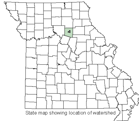
State map showing location of watershed

County: Randolph Nearby City: Moberly Length: 6.8 miles Pollutant: Low dissolved oxygen Source: Unknown