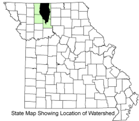
State Map Showing Location of Watershed

County: Harrison/Livingston Nearby City: Chillicothe Length: 70.6 miles Pollutant: E. coli bacteria Source: Rural nonpoint sources