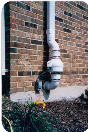
Typical fan and vent pipe.

Mitigation systems have been installed and operated at hundreds of homes near Superfund sites and other contaminated sites across the country.