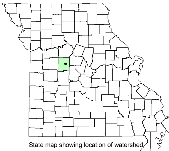
State map showing location of watershed

County: Pettis Nearby Cities: Sedalia Length of impairment: No mileage assigned Pollutant: Low Dissolved Oxygen Source: Unknown Point and Nonpoint Sources WBID: 0860U-01