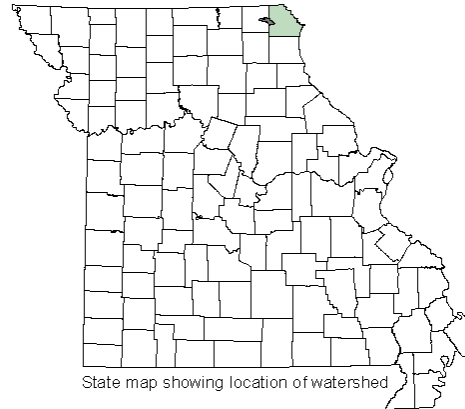
State map showing location of watershed

County: Knox Nearby Cities: Edina Area of impairment: 51 Acres Pollutant: Atrazine, Cyanazine Source: Corn, Sorghum Production