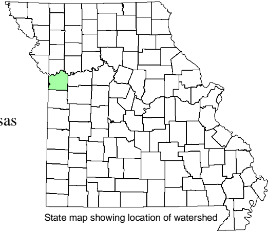
State map showing location of watershed

County: Jackson Nearby Cities: Kansas City Length of impairment: 3 miles Pollutant: Fecal Coliform bacteria Source: Wastewater discharges in Kansas