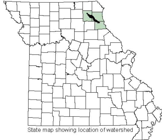
State map showing location of watershed

Note: This river was deleted from the 2004/2006 303(d) List because the criterion for manganese has been removed from Missouri's Water Quality Standards.